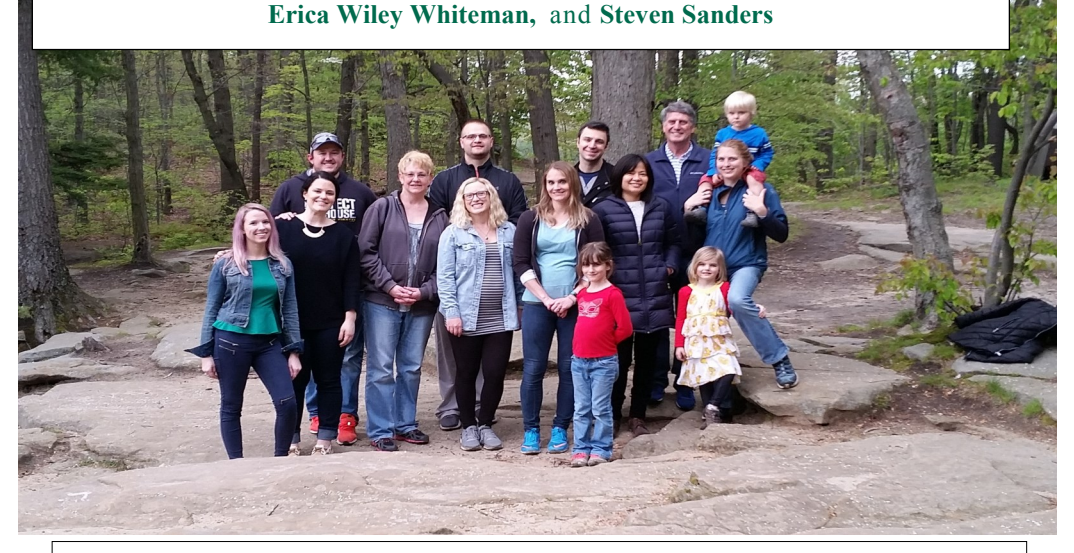
Students and faculty enjoying the annual picnic