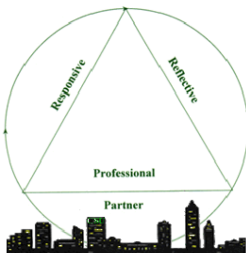
Figure 1: CSU Model of Teaching

The Cleveland State University (CSU) Model of Teaching is expressed as “The Teacher as a Reflective, Responsive Professional – A Partner in Learning.” CSU teacher education graduates are known for distinctive abilities that reflect the four knowledge bases that compose this model: Inquiry, Contextualism, Partnership, and Professionalism. As Figure 1 indicates, the four elements of the model are related and emanate from our common beliefs about learners and the teaching-learning process. Inquiry (reflective), Contextualism (responsive), and Partnership (partner) guide the design of program elements, e.g., program outcomes, instructional strategies and activities in courses, and program evaluation.