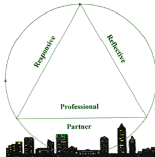
Figure 1: CSU Model of Teaching

The Cleveland State University (CSU) Model of Teaching is expressed as “The Teacher as a Reflective, Responsive Professional – A Partner in Learning.” CSU teacher education graduates are known for distinctive abilities that reflect the four knowledge bases that compose this model: Inquiry, Contextualism, Partnership, and Professionalism. As Figure 1 indicates, the four elements of the model are related and emanate from our common beliefs about learners and the teaching-learning process. Inquiry (reflective), Contextualism (responsive), and Partnership (partner) guide the design of program elements, e.g., program outcomes, instructional strategies and activities in courses, and program evaluation.